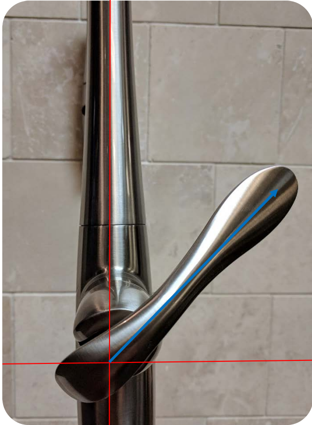
Original Max. Position